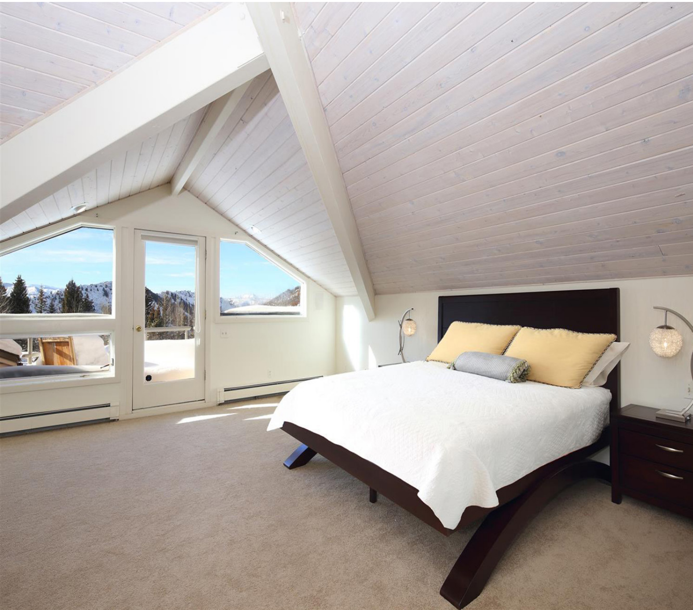
Home partially furnished, King in Master Bedroom